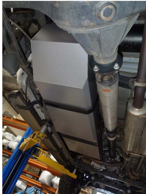
Optional Line-X Upgrade